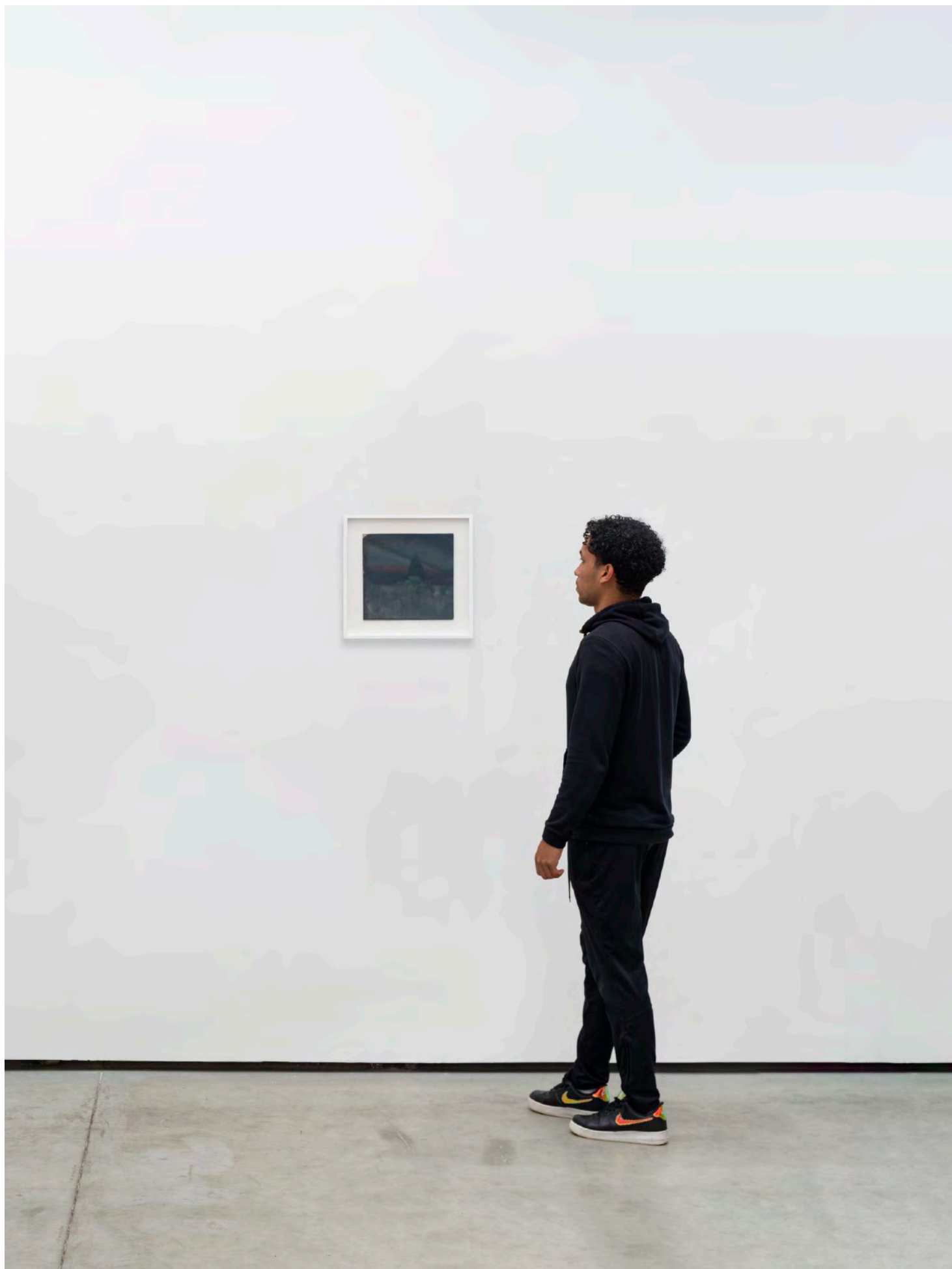
FRANK WALTER Untitled [Dark Grey & Red Sky with Black Pyramid], n.d. [s.d.]