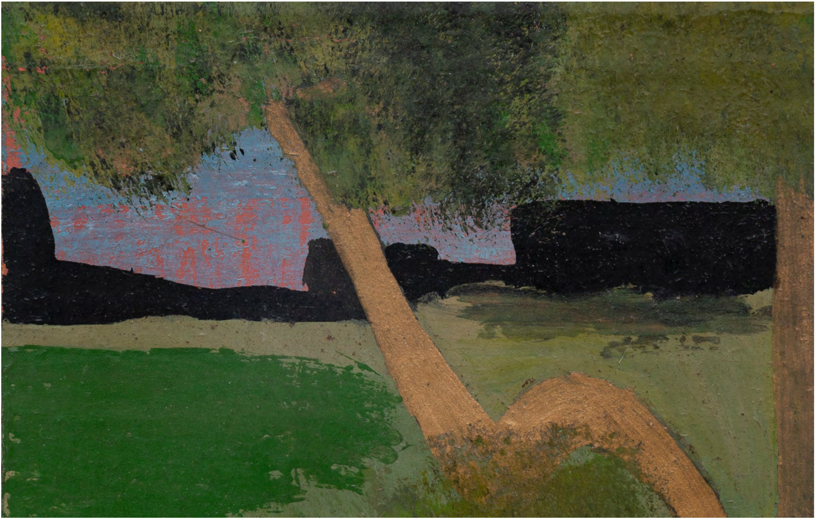
FRANK WALTER Tree with Golden Trunk and Black Boulders, n.d. [s.d.] Detail [Detalhe]