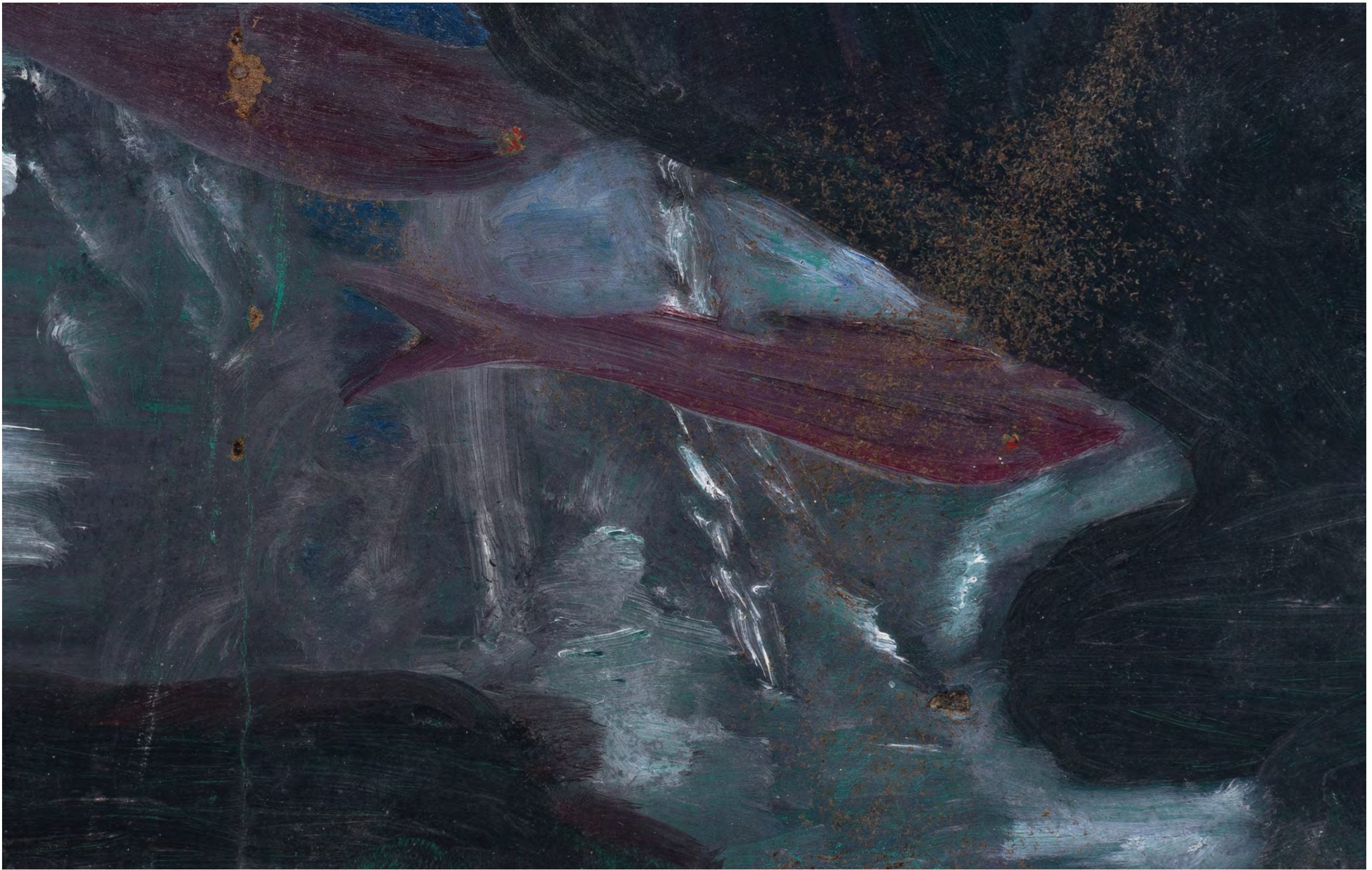
FRANK WALTER Fish in Surf, n.d. [s.d.] Detail [Detalhe]