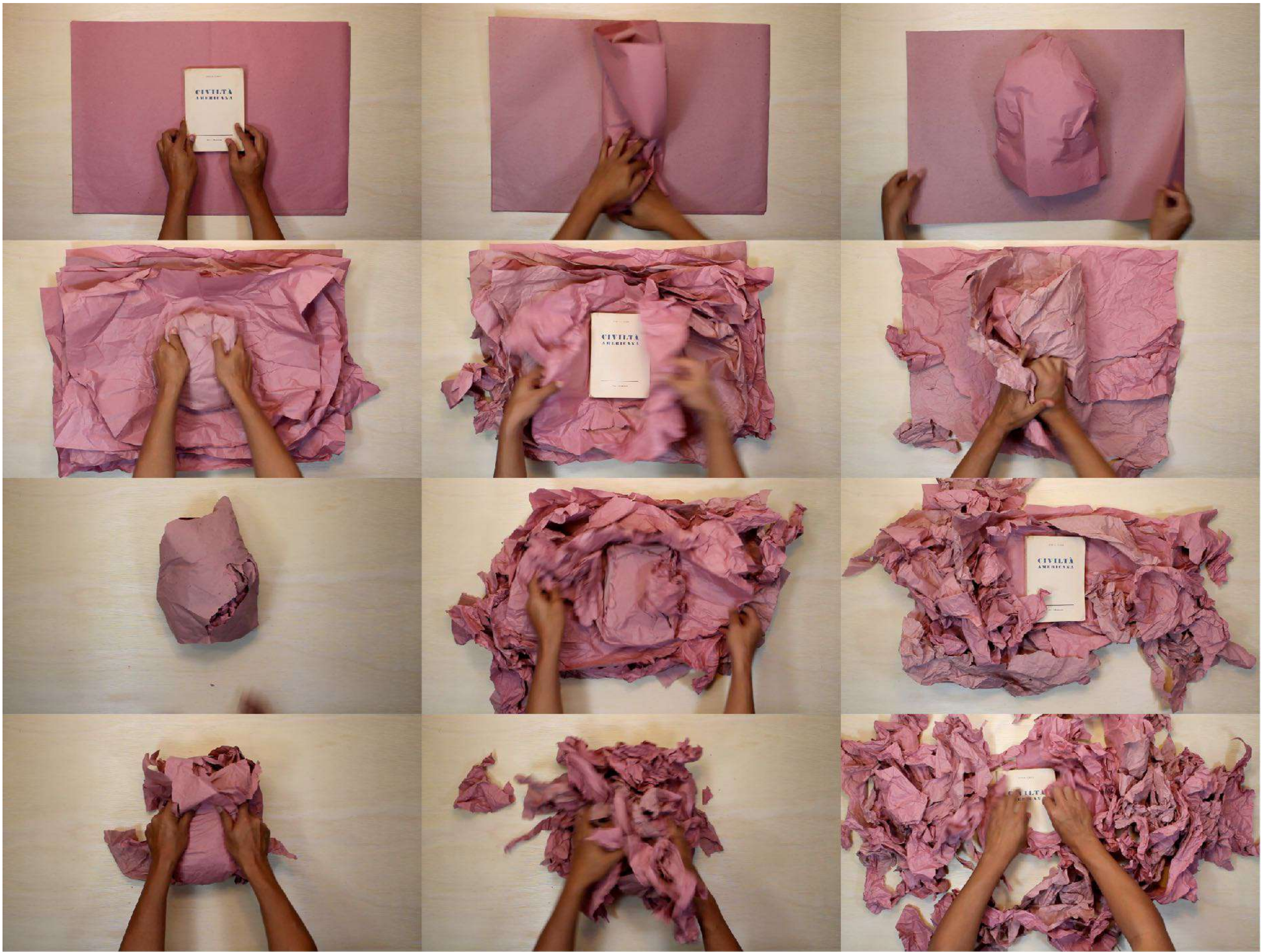
RODRIGO CASS Civiltà Americana, 2012 Video 8'53" | Watch | Password: cass Edition of 5 + 1 AP | 4/5