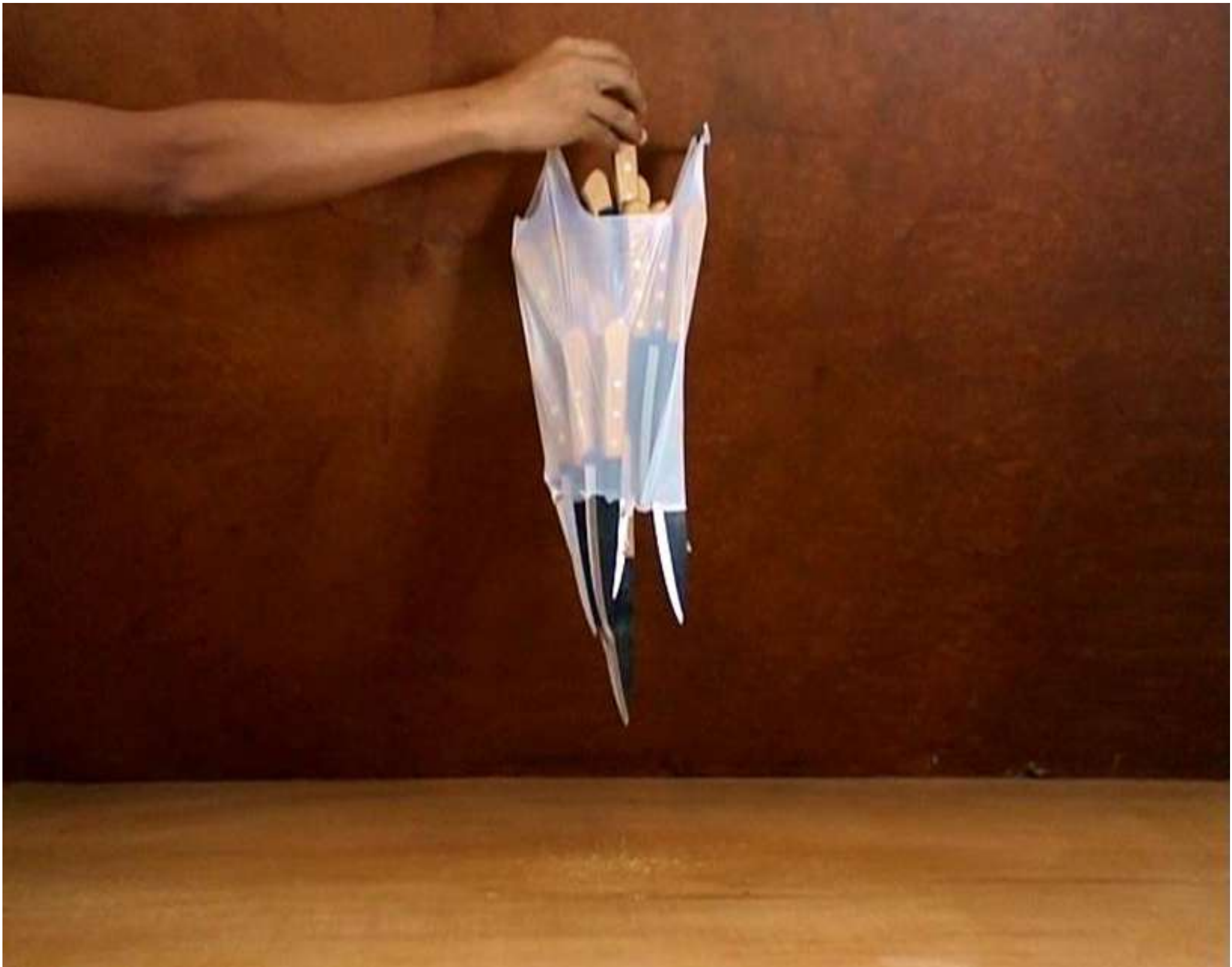
RODRIGO CASS Arma Branca, 2011 Video 18' | Watch Edition of 5 + 1 AP | 4/5